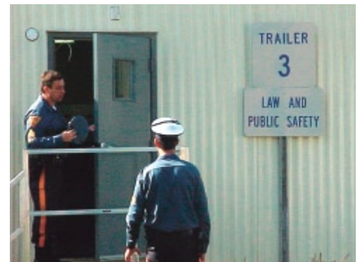
Above & Below: Modular buildings by Williams Scotsman are used as grief counseling centers at New York's Liberty State Park.